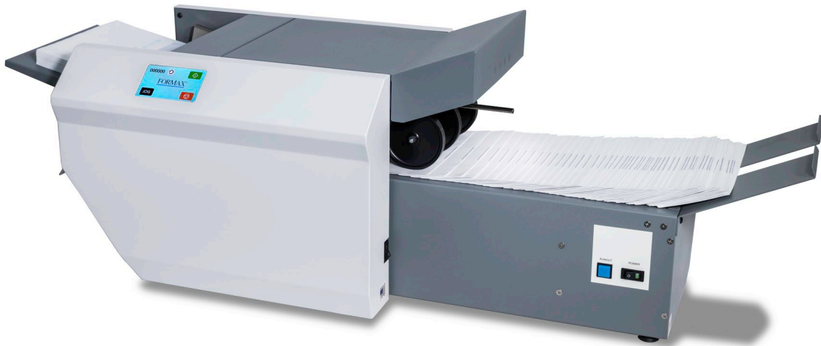
FD 2036 shown with optional conveyor

The FD 2036 AutoSeal® is a user-friendly high-volume solution for processing one-piece pressure sensitive mailers. The color touchscreen control panel uses internationally-recognized symbols in place of text, and includes a six-digit resettable counter. With a speed of up to 11,000 forms per hour, hopper capacity of up to 350 forms, and the ability to process forms up to 14" in length, the FD 2036 enables operators to complete daily processing jobs with ease.